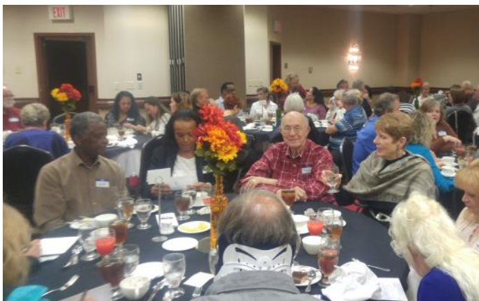
Side view of over 70 people who attended the banquet.