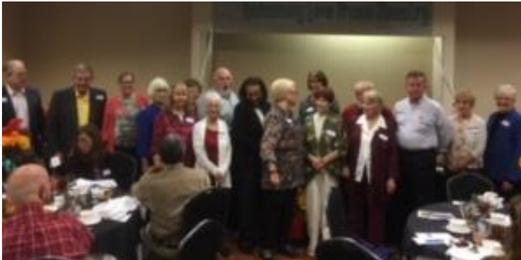
AMBASSADORS GROUP PHOTO